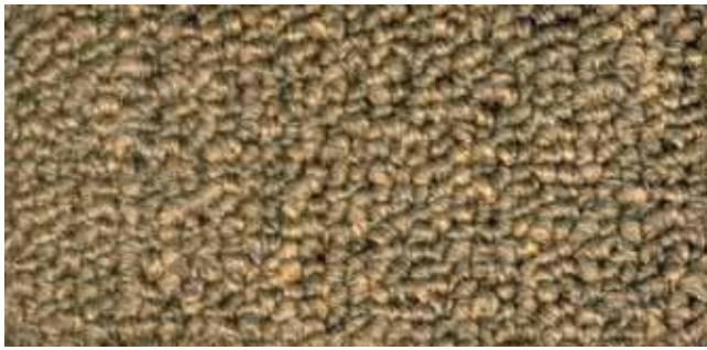
ST-22 Yellow Brown