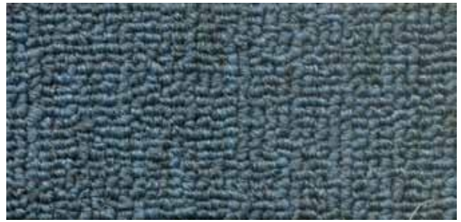
ST-88 Jewel Blue