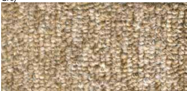
ST-78 Light Brown