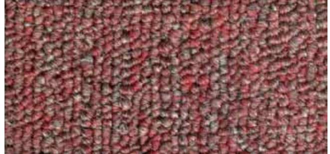
ST-14 Grey Red