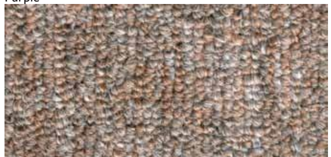
ST-28 Grey Brown