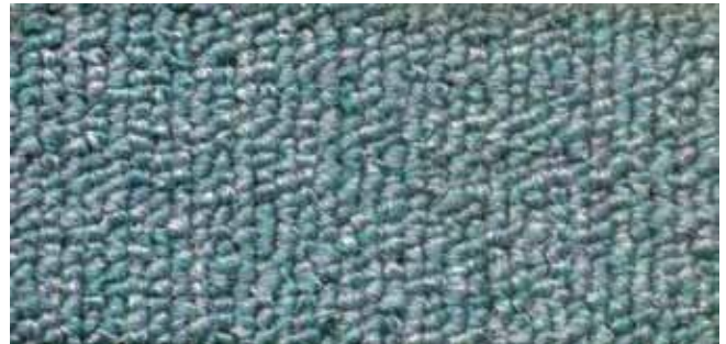
ST-13 Diamond Green