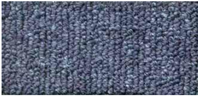
ST-29 Dark Blue