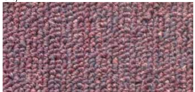
ST-30 Grape Purple