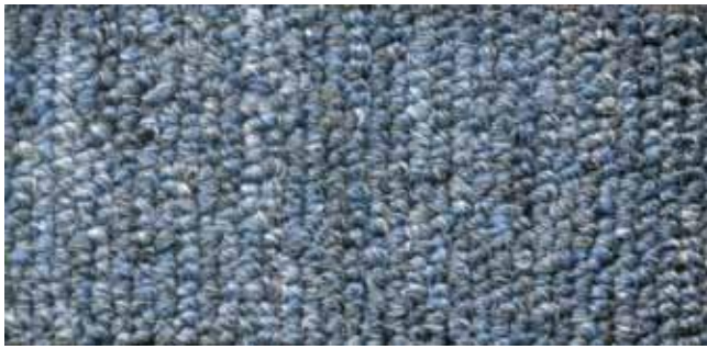
ST-12 Normal Blue