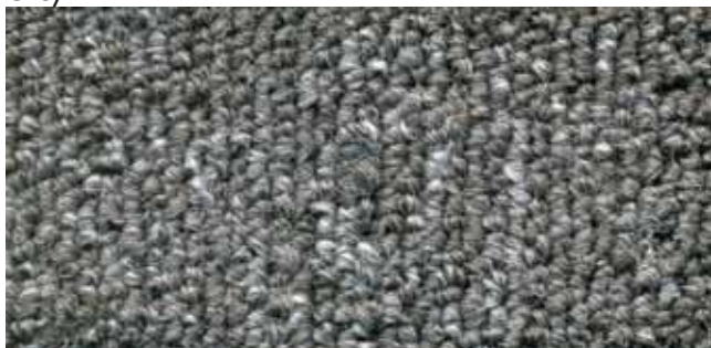
ST-06 Dark Grey