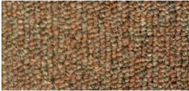
ST-68 Red Brown