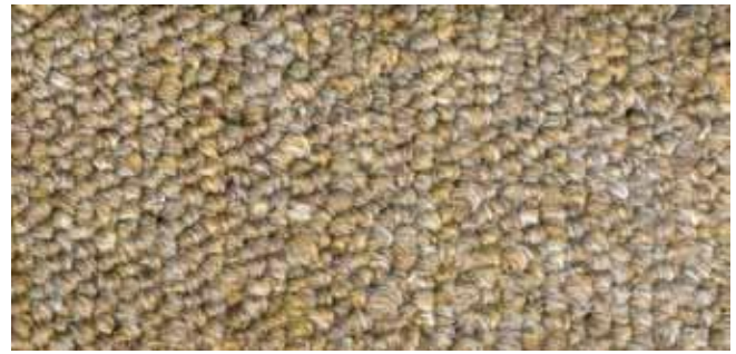
ST-31 Coffee Brown