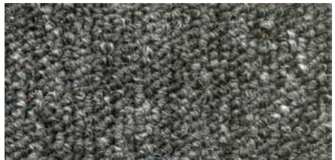
ST-09 Night Grey