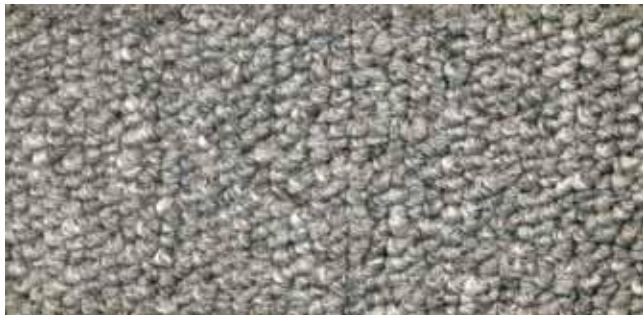
ST-04 Normal Grey